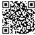
Best of Show info & links

All student media outlets with students attending the convention are eligible to enter the Associated Collegiate Press Best of Show competition.